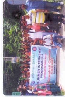
Students of the Summer Internship Programme by NSS Unit