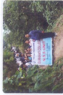
Trekking Programme Undertaken by NSS Unit