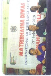
Celebration of Matribhasha Divas