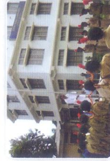
Flag Hoisting at the college Premises on Independence Day