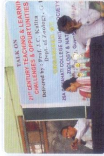
A talk organised by ZSA, Guwahati College Unit