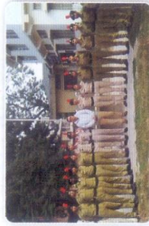
Principal with NCC Cadets on Republic Day