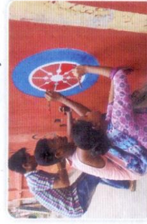
Wall Painting by NSS Unit in Swachhata Pakhwada Programme