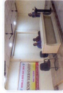
Awareness Programme on World AIDS Day