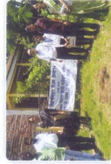
Celebration of World Environment Day in Collaboration with Pub-Guwahati High School.