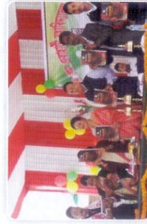
Release of the College Magazine