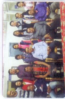
Meeting of the teachers and representatives of adopted village