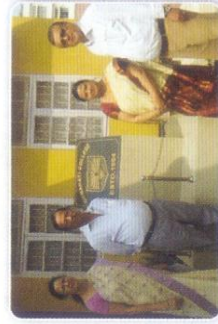
Academic Audit team in Guwahati College